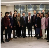
International Chinese Language Conference