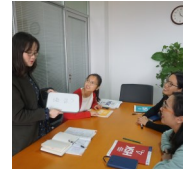
NCI Mandarin Teachers' Workshop