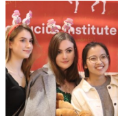
Christmas Party and Chinese Talent Showcase