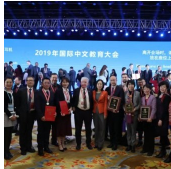
Fudan (NCI's partner university) Won Awards