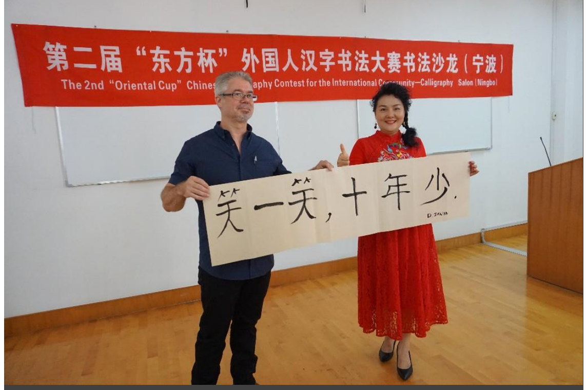
NCI Ningbo held the 'Oriental Cup' Chinese Calligraphy Salon

26 Sep, "Oriental Cup"—Chinese calligraphy salon for the international community in Ningbo was successfully held in Room 208 Sports Centre UNNC. This event was initiated and sponsored by the Oriental Fin Art Museum and was a part of the second national calligraphy competition of expatriates in China. 18 international staff and students participated the event. Read more