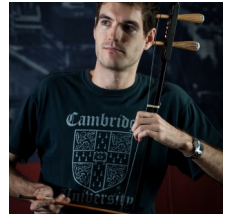
Playing Er Hu