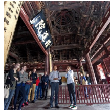
Visiting Baoguo Temple